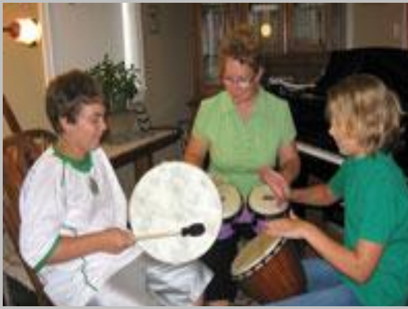
Accomplishing social skills, turn taking, and self-confidence